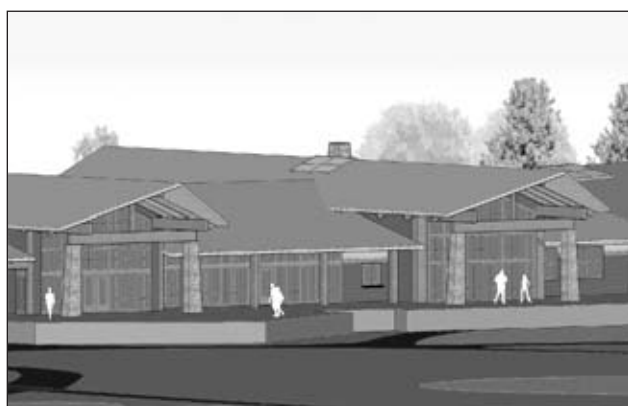
ROBERTSON, SHERWOOD ARCHITECTS PC

Shadow Hills Golf Course opened as a nine-hole course almost 50 years ago, in June 1962. The second nine opened